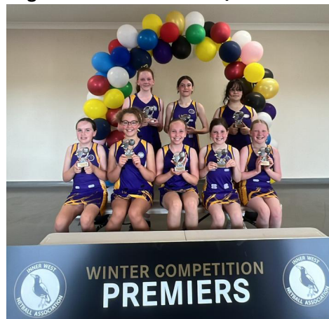
Robins Joint Premiers 14/3 Division